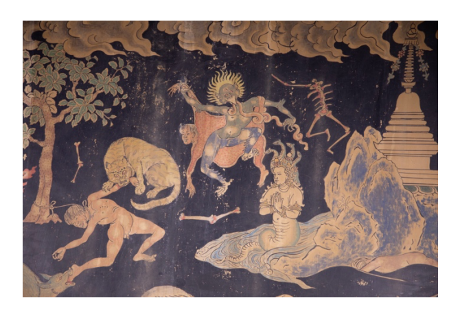
Fig. 8 Khyentse Chenmo (act. 15th century); Charnel Ground Scenes; east wall of the Upper Protector Chapel, middle floor, Gongkar Chode Monastery, Gongkar County, Lhokha, U region, central Tibet (present-day TAR, China); ca. 1464– 1476

Middle floor: The Protector Chapel features images of the great Sakya master Sachen Kunga Nyingpo (1092–1158) and the Indian mahasiddha Virupa, as well as charnel-ground scenes (fig. 8), with the yaksha Vaishravana and his Eight Horsemen (figs. 9 and 10).