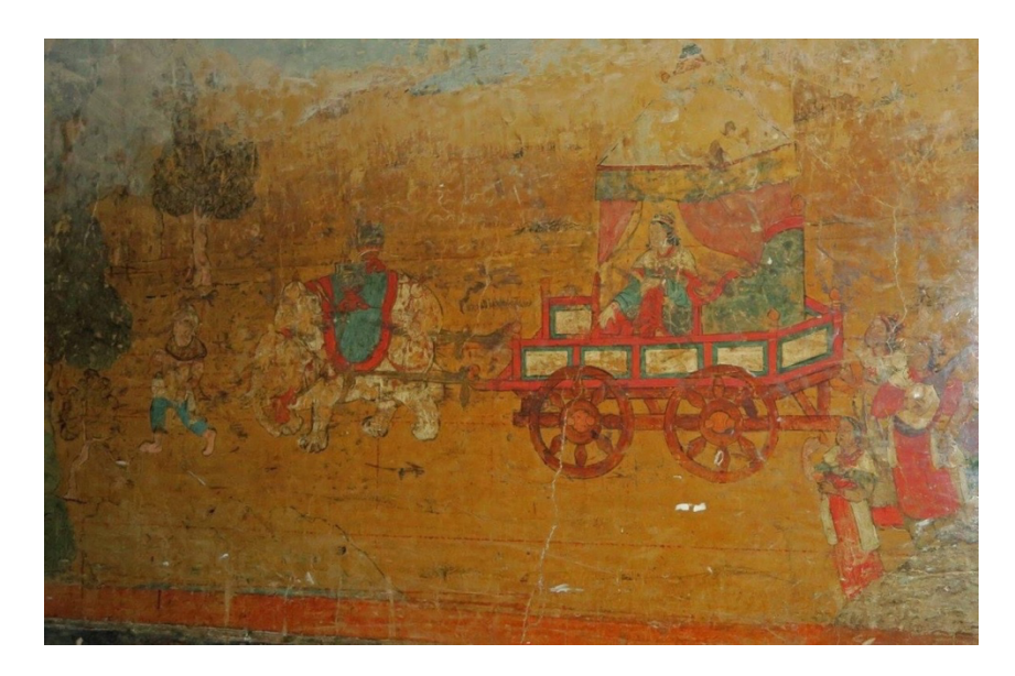
Fig. 7 Khyentse Chenmo (act. 15th century); Detail of Twelve Deeds of the Buddha, showing Queen Mayadevi's Carriage; Circumambulation Corridor, ground floor, Gongkar Chode Monastery, Gongkar County, Lhokha, U region, central Tibet (present-day TAR, China); ca. 1464–1476; photograph by Karl Debreczeny

Middle floor: The Protector Chapel features images of the great Sakya master Sachen Kunga Nyingpo (1092–1158) and the Indian mahasiddha Virupa, as well as charnel-ground scenes (fig. 8), with the yaksha Vaishravana and his Eight Horsemen (figs. 9 and 10).