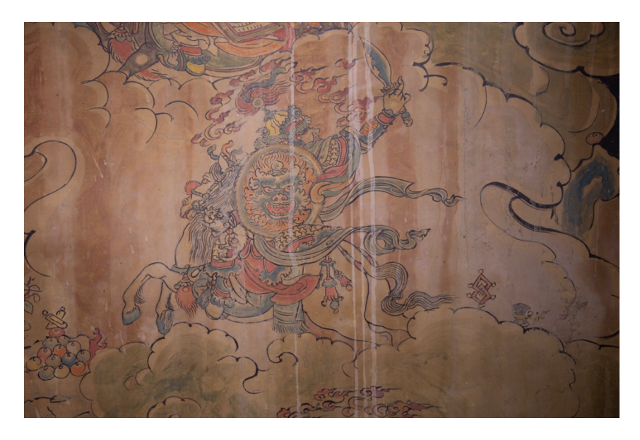
Fig. 10 Khyentse Chenmo (act. 15th century); Detail of Vaishravana and His Eight Horsemen; Upper Protector Chapel, middle floor, Gongkar Chode Monastery, Gongkar County, Lhokha, U region, central Tibet (present-day TAR, China); ca. 1464–1476

The highest tantric deities, including the nine deities of Hevajra, are painted in the Hevajra Chapel (fig. 11 and 12). The Lamdre Chapel has wall paintings of Vajradhatu, while the Vajradhatu Chapel features Maitreya and 996 other bodhisattvas.