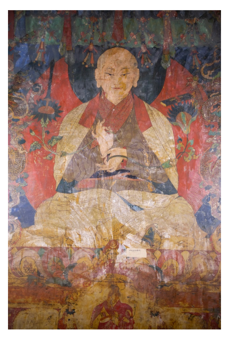
Fig. 6 Khyentse Chenmo (act. 15th century); Detail showing Sachen Kunga Nyingpo (1092–1158), one of the White-Clad Masters of Sakya; left wall, entrance to Inner Sanctum, ground floor, Gongkar Chode Monastery, Gongkar County, Lhokha, U region, central Tibet (present-day TAR, China); ca. 1464–1476; photograph by Tsechang Penba Wangdu

The inner Circumambulation Corridor depicts the twelve great deeds of the Buddha (fig. 7), and the Great Tantric Chapel, or Vajrabhairava Chapel, includes scary scenes of charnel grounds.