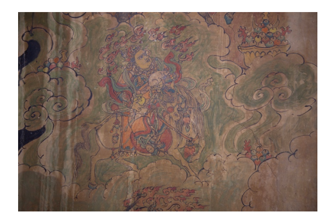
Fig. 9 Khyentse Chenmo (act. 15th century); Detail of Vaishravana and His Eight Horsemen; Upper Protector Chapel, middle floor, Gongkar Chode Monastery, Gongkar County, Lhokha, U region, central Tibet (present-day TAR, China); ca. 1464–1476; photographs by Tsechang Penba Wangdu