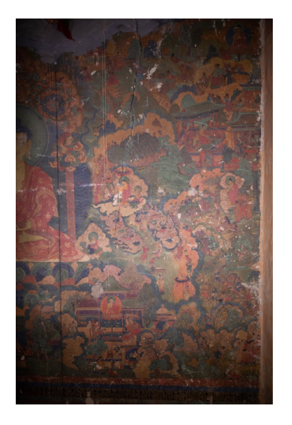
Fig. 4 Khyentse Chenmo (act. 15th century); Right narrative detail of Main image of Buddha Shakyamuni from chapters 71–72 in the Wish-Fulfilling Vine (Bodhisattvavadanakalpalata); southern mural painting of the original Main Assembly Hall, ground floor, Gongkar Chode Monastery, Gangto Village, Gongkar County, Lhokha, U region, central Tibet (present-day TAR, China); ca. 1464–1476; photograph by Tsechang Penba Wangdu, 2018