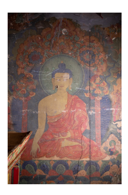
Fig. 3 Khyentse Chenmo (act. 15th century); Main image of Buddha Shakyamuni from chapters 71–72 in the Wish-Fulfilling Vine (Bodhisattvavadanakalpalata); southern mural painting of the original Main Assembly Hall, ground floor, Gongkar Chode Monastery, Gangto Village, Gongkar County, Lhokha, U region, central Tibet (present-day TAR, China); ca. 1464–1476; photograph by Tsechang Penba Wangdu, 2018

Ground floor: The main building has a total area of about 9,040 square feet (840 square meters), with each higher floor smaller than the one below it.<sup>2</sup> In the Main Assembly Hall, the walls are painted with the one hundred deeds of the Buddha, illustrating the popular narratives as told in the Wish-Fulfilling Vine (Bodhisattvavadanakalpalata) (figs. 1, 3 and 4). In the Great Protector Chapel, paintings depict charnel grounds, a common setting for the wrathful deities who are venerated there (fig. 5).