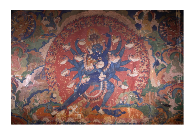
Fig. 11 Khyentse Chenmo (act. 15th century); Hevajra; northern mural painting in Hevajra Chapel, middle floor, Gongkar Chode Monastery, Gongkar County, Lhokha, U region, central Tibet (present-day TAR, China); ca. 1464–1476

The highest tantric deities, including the nine deities of Hevajra, are painted in the Hevajra Chapel (fig. 11 and 12). The Lamdre Chapel has wall paintings of Vajradhatu, while the Vajradhatu Chapel features Maitreya and 996 other bodhisattvas.