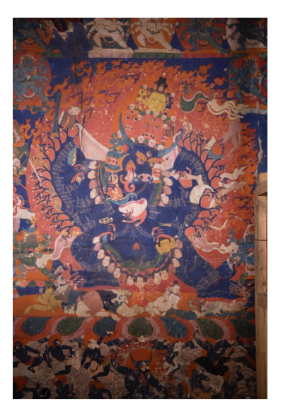
Fig. 12 Khyentse Chenmo (act. 15th century); Vajrabhairava Solitary of Ra Lotsawa Tradition; western mural painting in Hevajra Chapel, middle floor, Gongkar Chode Monastery, Gongkar County, Lhokha, U region, central Tibet (present-day TAR, China); ca. 1464–1476; photograph by Tsechang Penba Wangdu, 2018