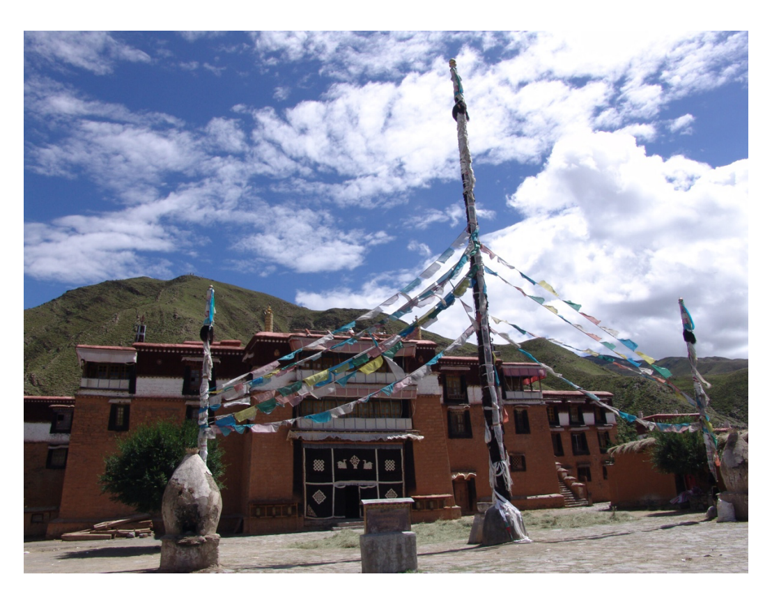
Fig. 2 Exterior of Gongkar Chode Monastery, Gangto Village, Gongkar County, Lhokha, U region, central Tibet (present-day TAR, China)

At the beginning of the fifteenth century, two new distinctive artistic traditions of Tibetan painting and sculpture arose in central Tibet: the Khyentse and Menla traditions.<sup>1</sup> The artist Khyentse Chenmo Genyen Nampar Gyelwa established the Khyentse tradition, which is named after him, including the Khyentse painting style (or Khyenri), exemplified by his surviving murals at Gongkar Chode Monastery (fig. 2).