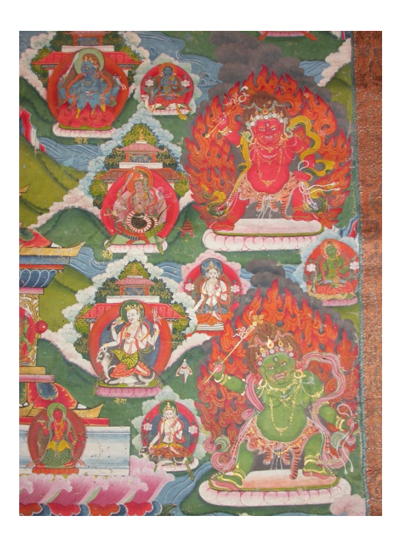
Fig. 5 Detail of Painted Scroll of Bhimaratha Ritual, showing krodha and planetary deities to the right of the chaitya; Hāku Bāhāḥ, Kathmandu, Nepal; dated by inscription January 1830; Private collection; photograph by Alexander von Rospatt, December 20, 2003, in home of Mischa Jucker, Basel, Switzerland