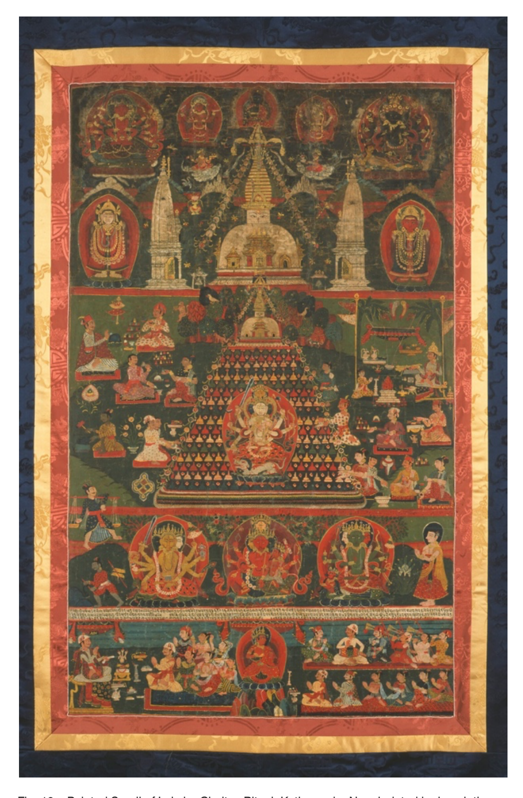
Fig. 10 Painted Scroll of Laksha Chaitya Ritual; Kathmandu, Nepal; dated by inscription January 1808; opaque watercolor on cotton cloth; 38 \times 24 in. (96.5 \times 61 cm); Asian Art Museum of San Francisco, The Avery Brundage Collection; B61 D10+