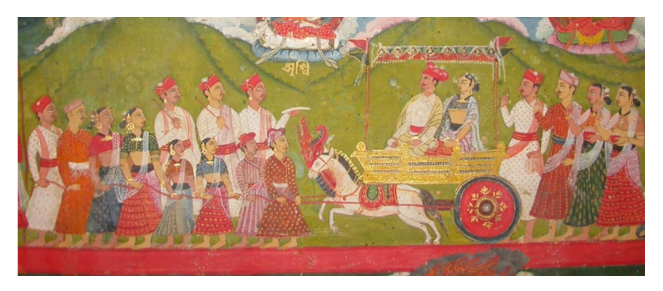
Fig. 8 Detail of Painted Scroll of Bhimaratha Ritual, showing the chariot ( ratha ) with the elders being towed by grandchildren and great-grandchildren; Hāku Bāhāḥ, Kathmandu, Nepal; dated by inscription January 1830; private collection; photograph by Alexander von Rospatt, December 20, 2003, in home of Mischa Jucker, Basel, Switzerland